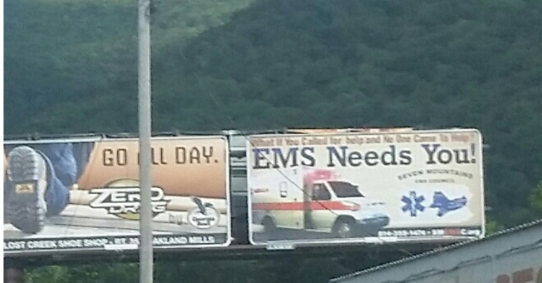
Figure 2 3